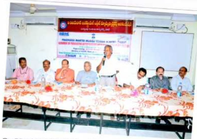
BANK REPRESENTATIVE APPRAISING ABOUT MUDRA SCHEME TO PARTICIPANTS