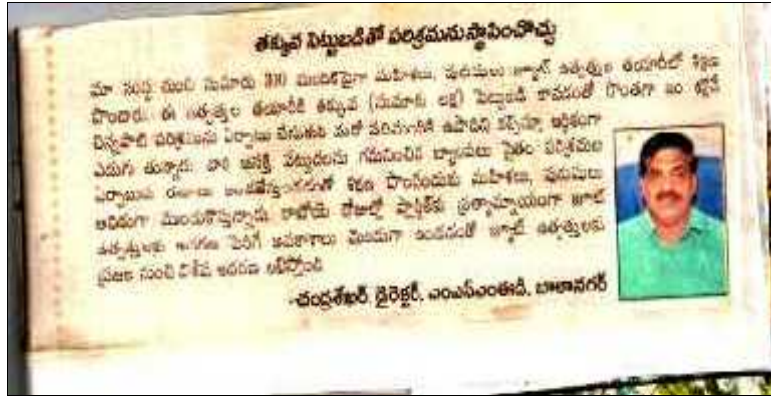
Andhra Jyothi on Jute Products