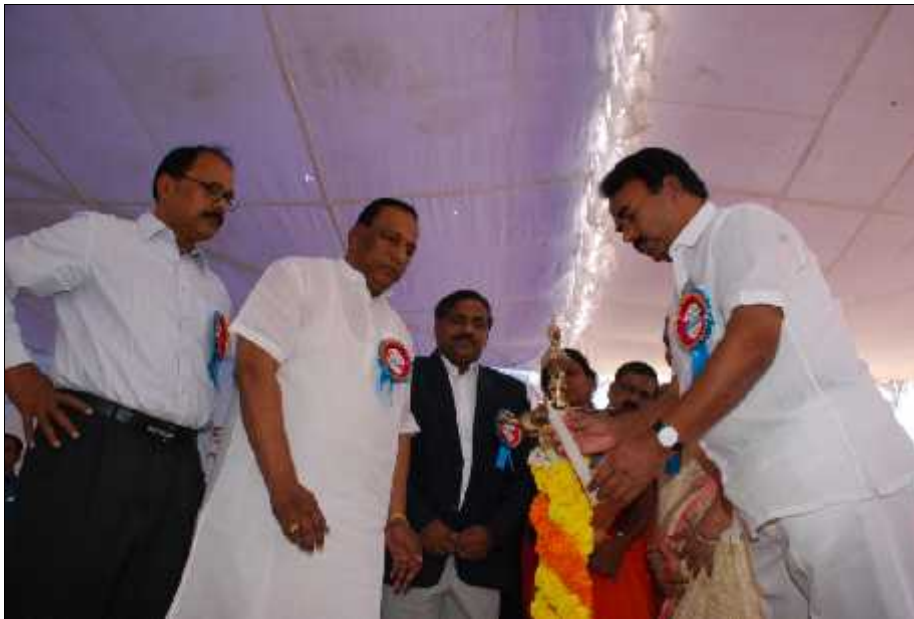
Lighting of Lamp by Shri Jupally Krishna Rao, Hon'ble Minister of Industries, Textile & Sugar