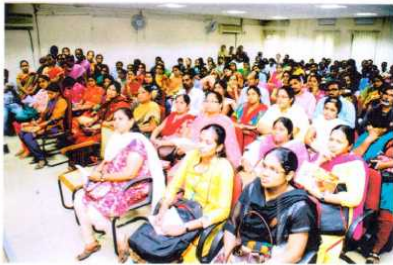
A GIMPSE OF THE PARTICIPANTS ATTENDING THE PROGRAMME