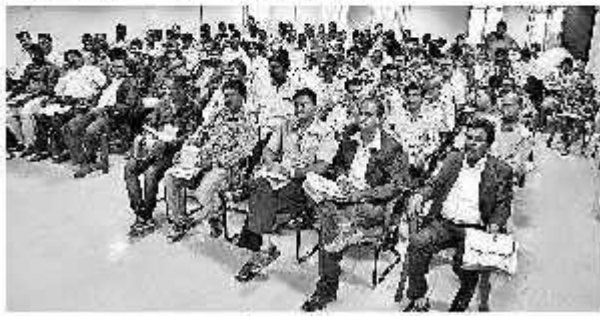
కార్యక్రమంలో పాల్గొన్న విద్యార్థులు

SVDP Programme at MSME-DI, Hyderabad with SCR