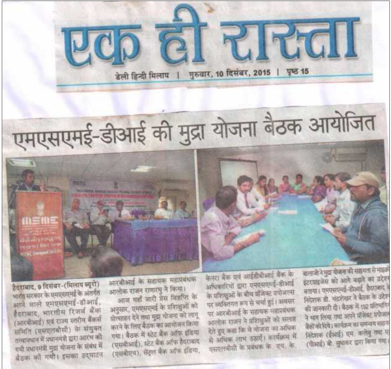
Ek HI Rastha on MUDRA workshop dated 10.12.2015