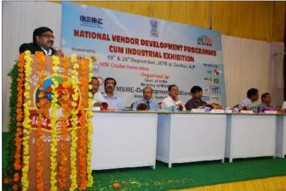
MSME EXPO at Guntur