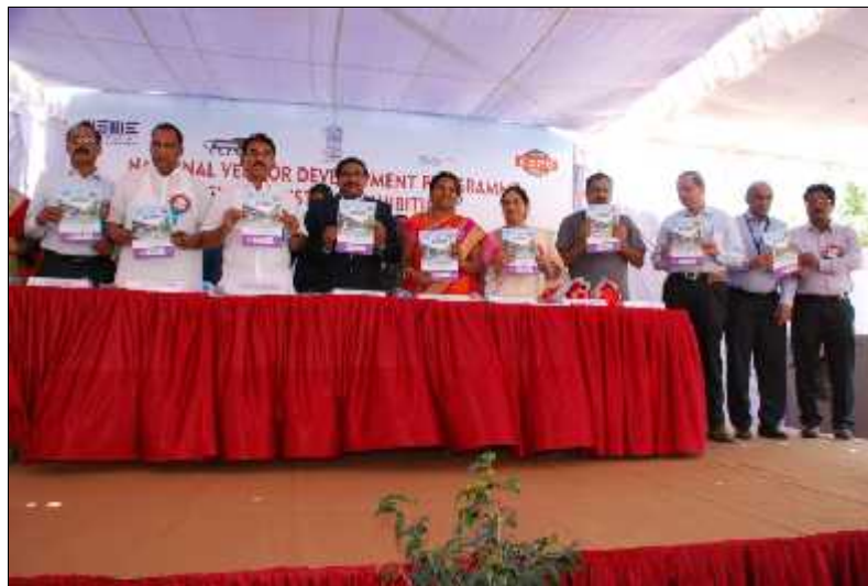
Release of NVDP Souvenir