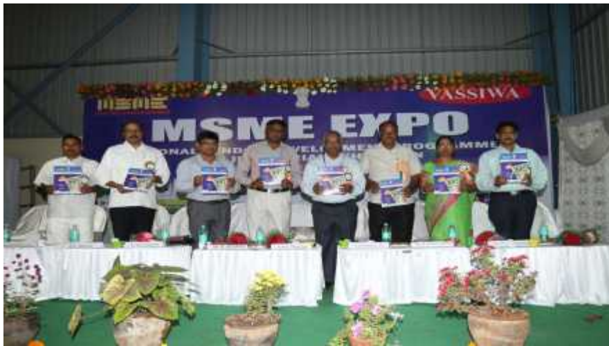
Release of Souvenir at NVDP, Visakhapatnam