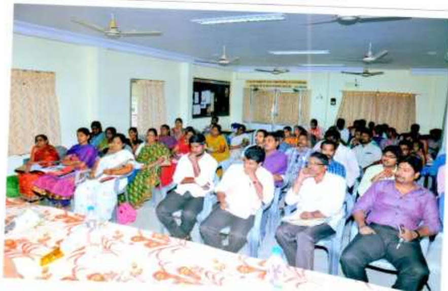
A GLIMPSE OF THE CROWD WHO ATTENDED THE PROGRAMME