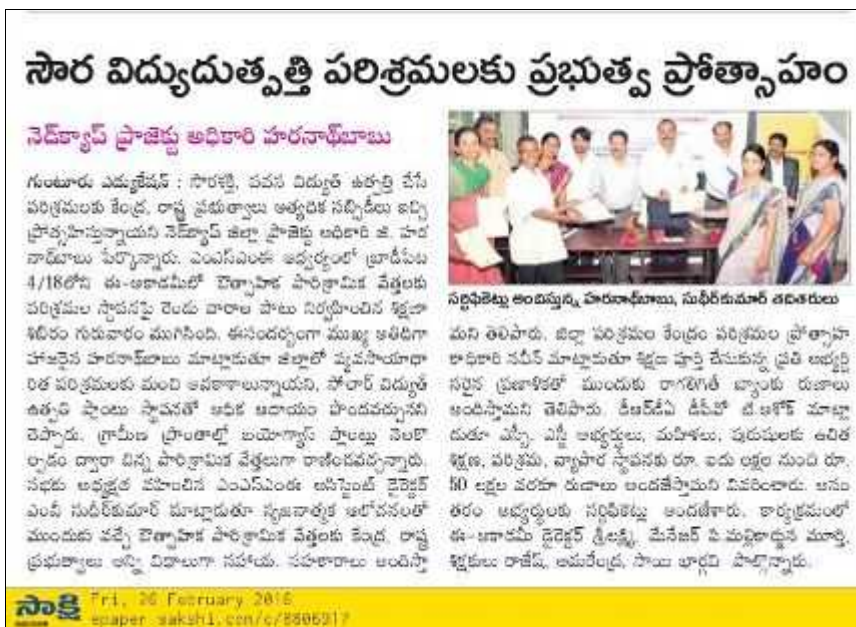
Sakshi on EDP dated 26.02.2016