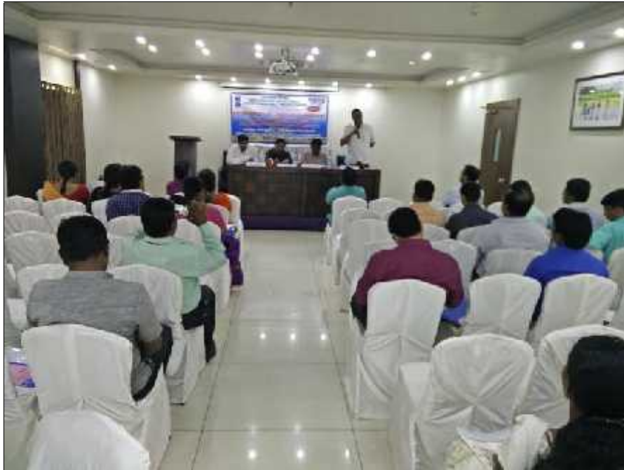
QMS/QTT Awareness Programme