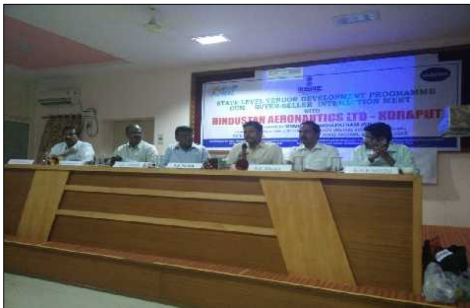
SVDP for HAL