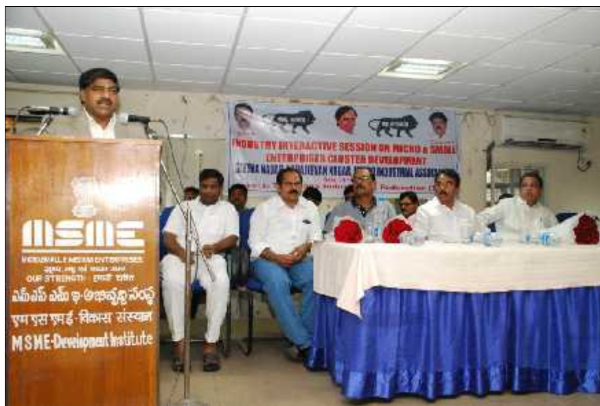
Interaction with Industrial Association for Cluster Development