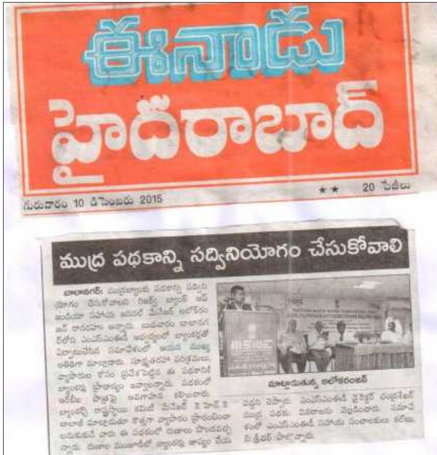
Ee- Nadu on MUDRA workshop dated 10.12.2015