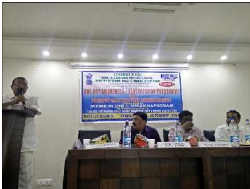
Product Certification Programme