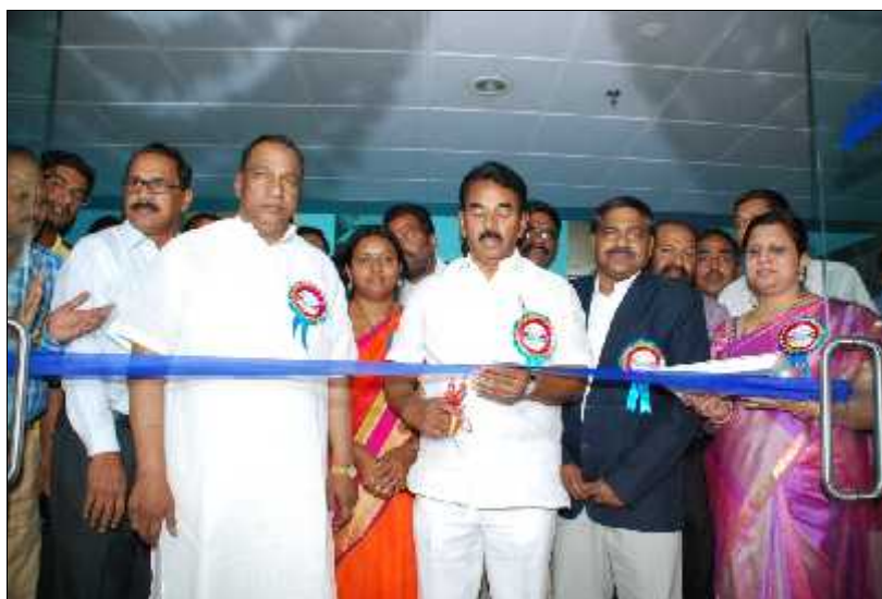
Stall Inauguration by Shri Jupally Krishna Rao