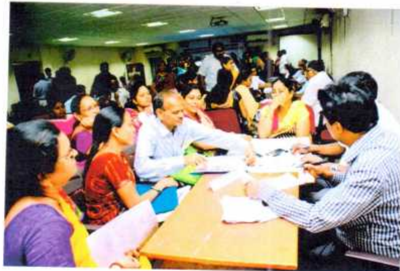
BANKERS INTERACTING WITH ENTREPRENEURS AND ACCEPTING PROJECT PROPOSALS FROM THEM