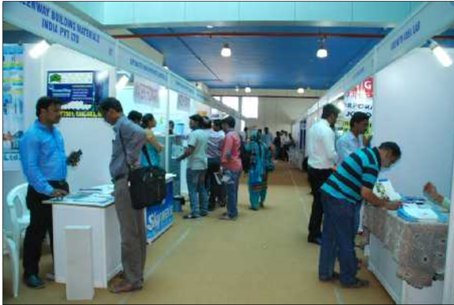
A view of the MSME Stalls