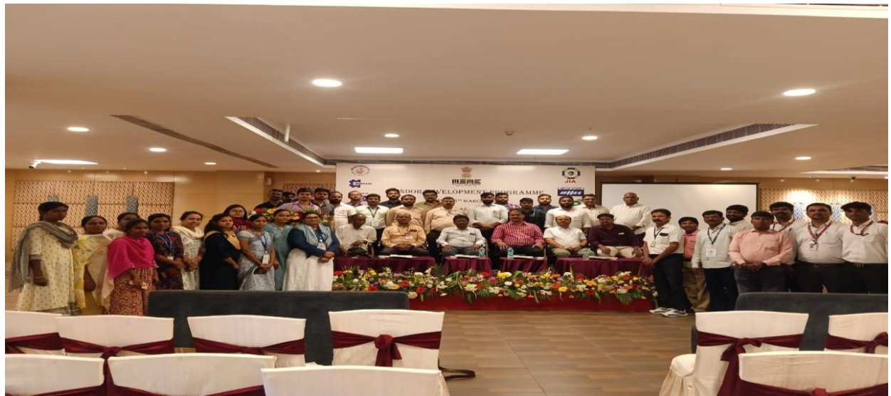
Group photo with all PSU's & Stall holders