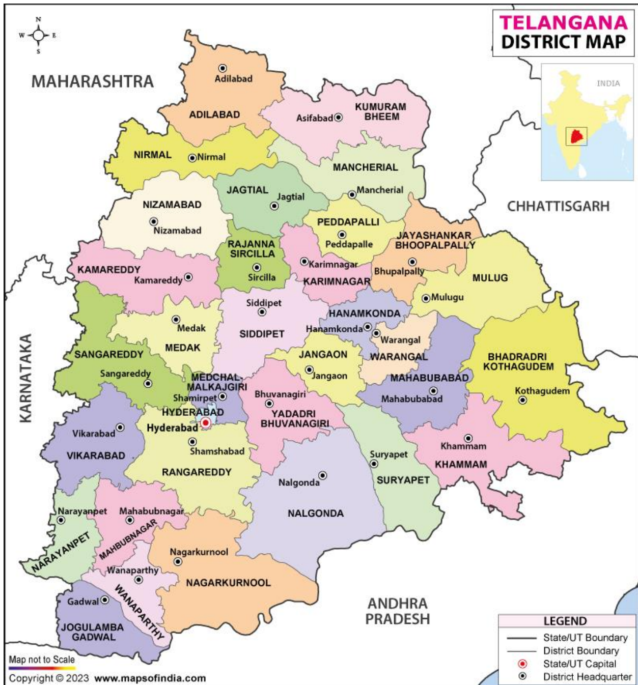
Telangana with 33 Districts

The annual rainfall is between 900 and 1500mm in northern Telangana and 700 to 900mm in southern Telangana, from the southwest monsoons. Telangana contains various soil types, some of which are red sandy loams (Chalaka), Red loamy sands (Dubba), lateritic soils, salt-affected soils, alluvial soils, shallow to medium black soils and very deep black cotton soils. These soil types allow the planting of a variety of fruits and vegetable crops such as mangoes, oranges, coconut, sugarcane, paddy, banana and flower crops