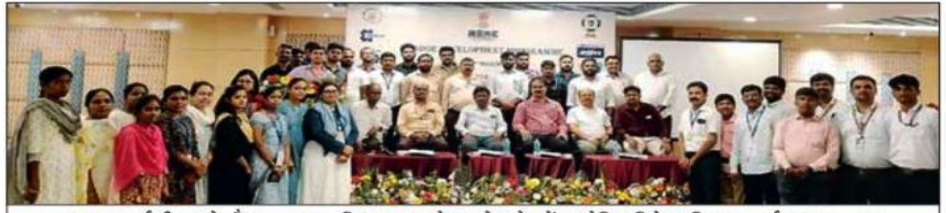
एमएसएमई डीएफओ, हैदराबाद द्वारा टूरिज्म प्लाजा होटल, बेगमपेट में आयोजित विक्रेता विकास कार्यक्रम का दृश्य।