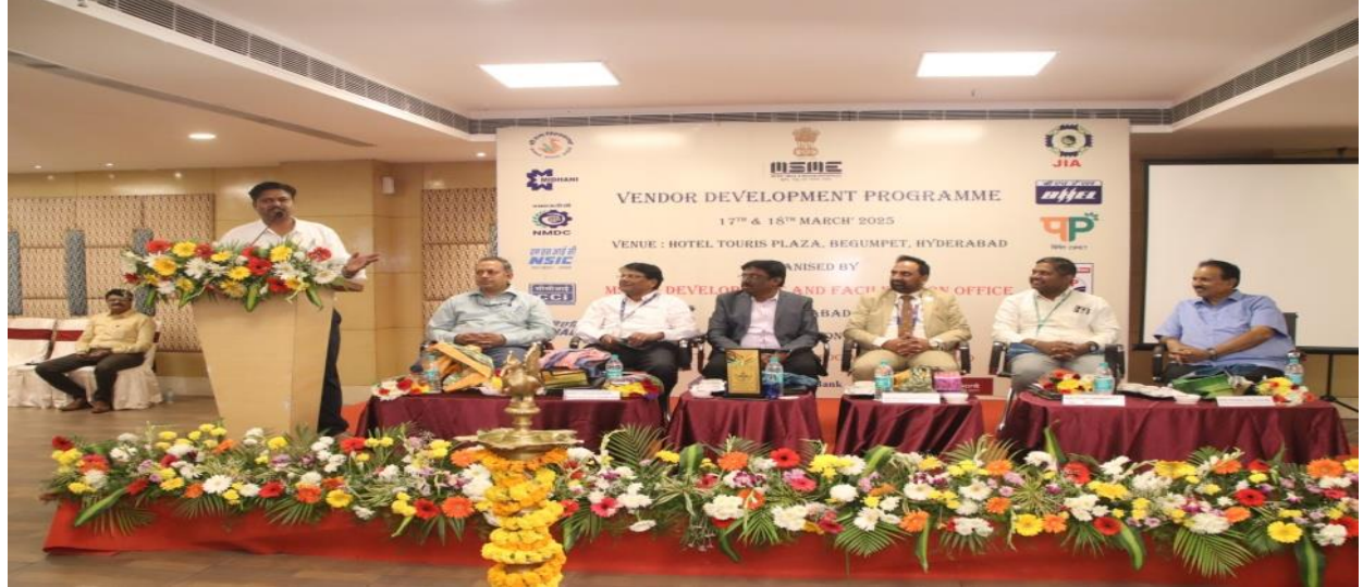
PSUs such as ONDC, HAL, CCI, NMDC, BHEL, PGCIL, BDL & Central Warehousing Corporation participated.