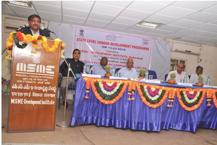
Organized a SVDP in association with HPCL on 13.03 2018 at MSME-Development Institute, Hyderabad.