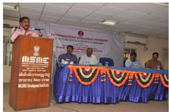
EDP conducted at Hyderabad from 12.02.2018 to 23.02.2018 24 prospective entrepreneurs participated in the programme