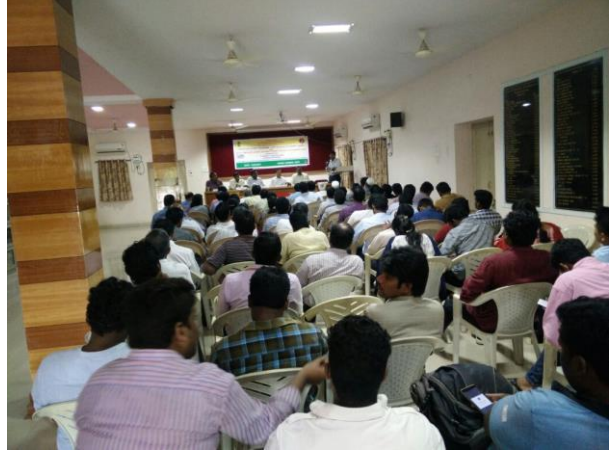
State Level Vendor Development Programme Conducted in Visakhapatnam.