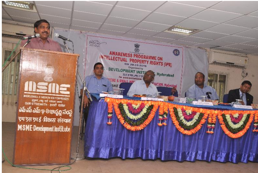
One day Awareness Programme on Intellectual Property Rights (IPR) on 20-03-2018 in association with Balanagar Micro and Small Industries Association, Balanagar, Hyderabad.