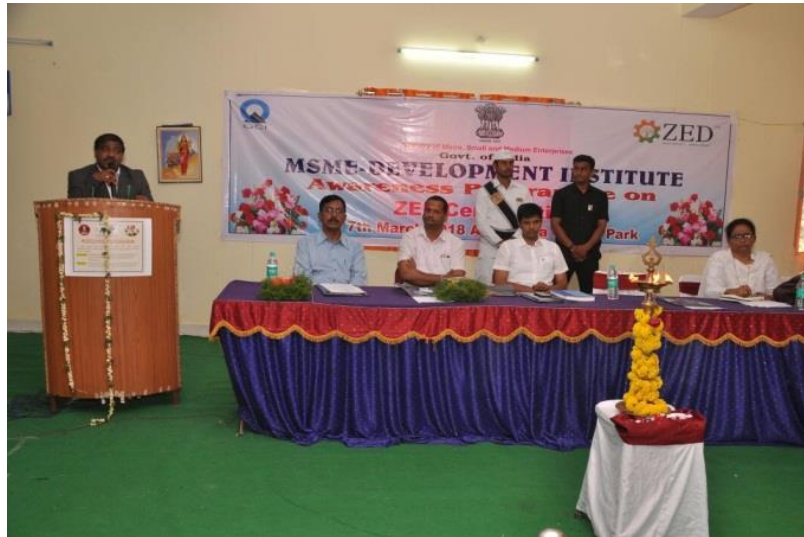
Awareness Programme on ZED conducted at Siricilla Textile Park on 07.03.2018