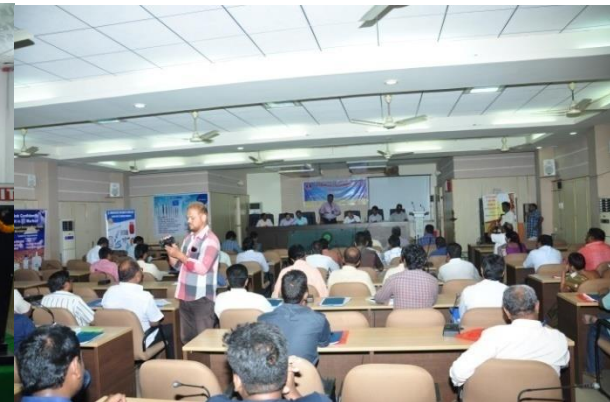
Management Development Programme and ZED Programme conducted by Br. MSME-DI, Visakhapatnam