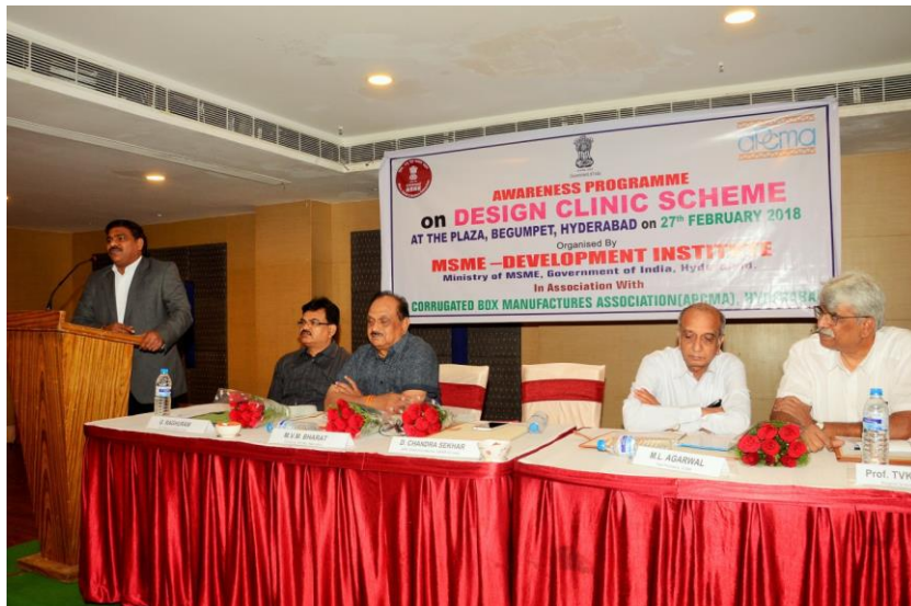
Awareness Programme on Design Clinic Scheme at The Plaza, Begumpet, Hyderabad on 27th February 2018