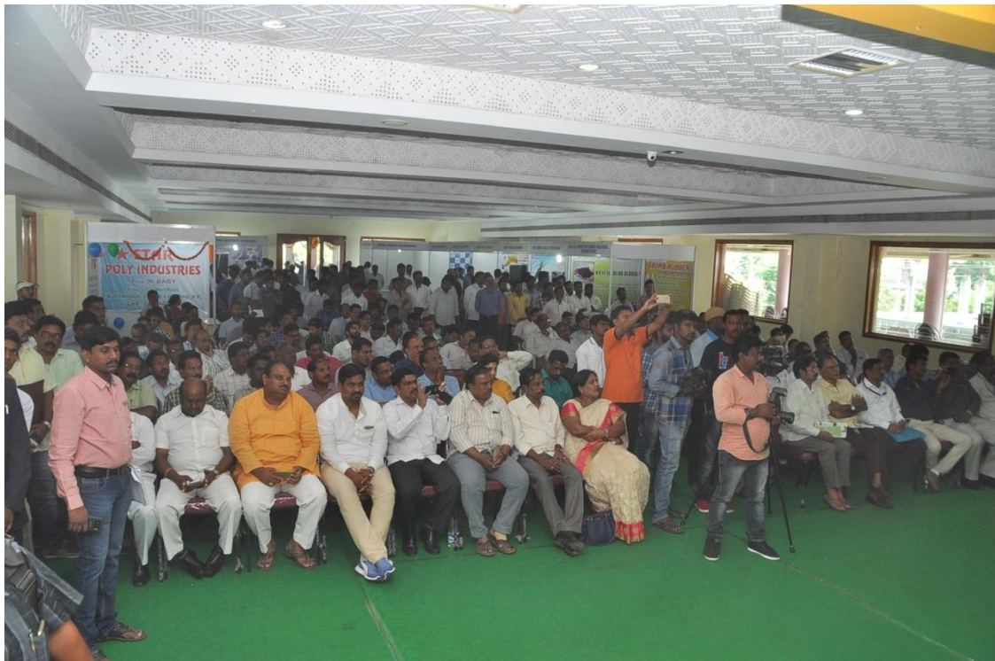
Delegates and Dignitaries in EXPO at Rajahmundry