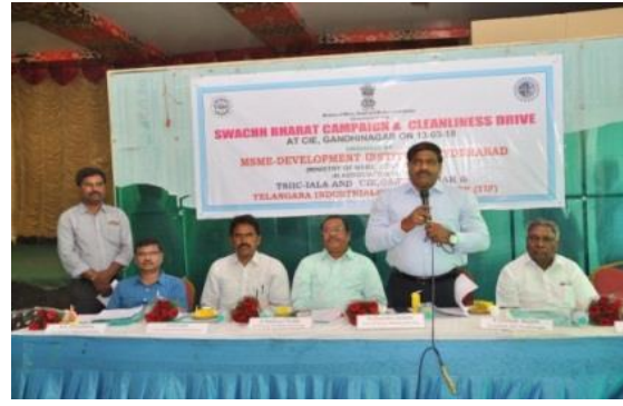
Swachh Bharat Campaign and Cleanliness drive conducted at Gandhinagar Industrial Estate on 13.03.2018