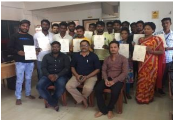
ESDP on Computer Accounting with Tally conducted at Adilabad. 20 SC candidates participated in the programme