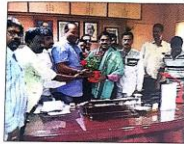
బాలానగర్, మార్చి 20 : కేంద్ర ప్రభుత్వ పథకాలను మైక్రోస్మైల్ ఇండస్ట్రీస్ పరిమళియాలని కోరుతూ బాలానగర్ మైక్రోస్మైల్ ఇండస్ట్రీస్ అసోసియేషన్ ఆధ్వర్యంలో బాలానగర్ లోని కేంద్ర ప్రభుత్వ కార్యాలయంలో 'మైక్రోస్మైల్ ఇండస్ట్రీస్' కార్యక్రమం నిర్వహించారు. ఈ సందర్భంగా బాలానగర్ లోని కేంద్ర ప్రభుత్వ కార్యాలయంలో 'మైక్రోస్మైల్ ఇండస్ట్రీస్' కార్యక్రమం నిర్వహించారు.

PUBLIC NOTICE [The General public are hereby in-] పాఠక తదితరులు పాల్గొన్నారు.