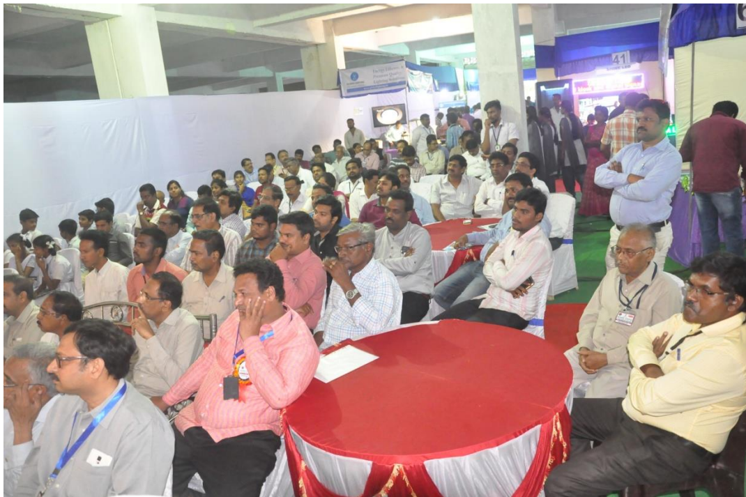
Delegates and Dignitaries in EXPO at Visakhapatnam