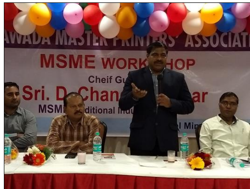
Awareness Programme on MSE-CDP for Master Printers Cluster, Vijayawada on 14.02. 2018