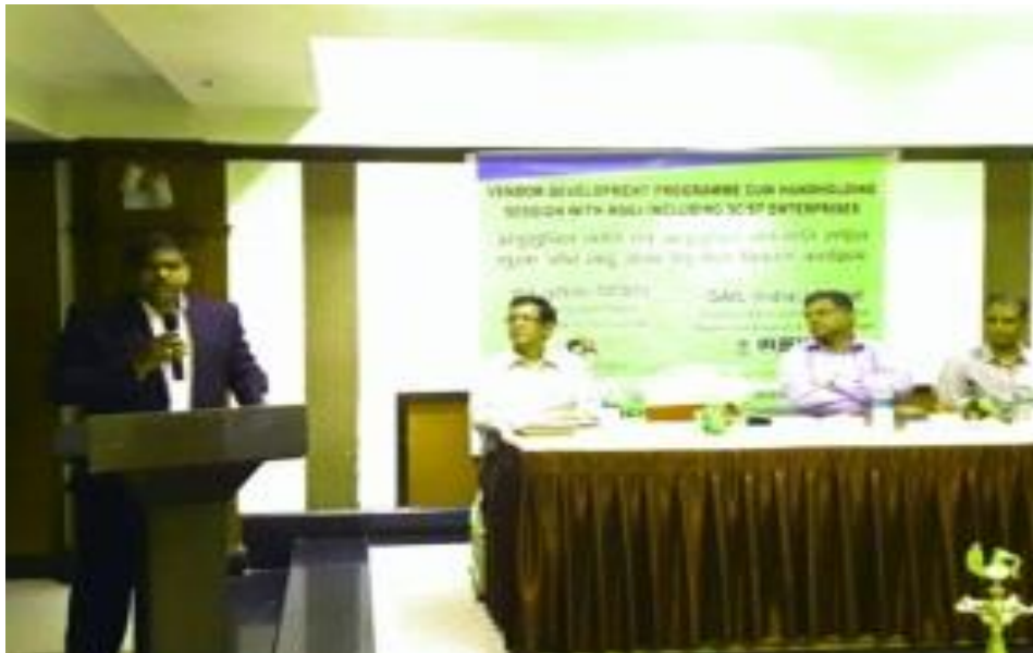
State level Vendor development programme organized with Gas Authority of India Limited (GAIL), Vijayawada