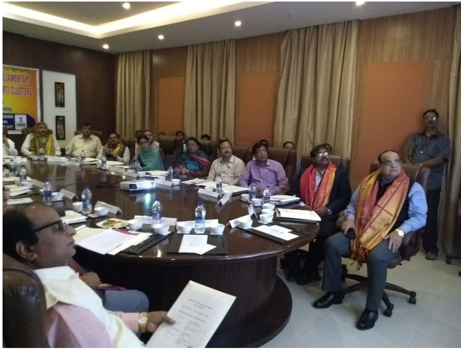
Parliamentary Standing Committee on Industries reviewing the progress of clusters at Tirupati on 17.02.2018