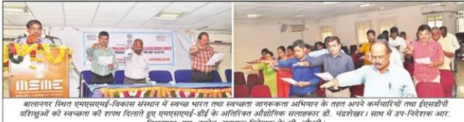
బాలానగర్ (బీఆర్ఎస్) విభాగ సంఘం నేతృత్వంలోని బాలానగర్ జాతీయ అభివృద్ధి కమిటీలోని కార్యకర్తలు బాలానగర్ లోని కేంద్ర ప్రభుత్వ కార్యాలయంలో 'కెలీ హిందీ మిలాప్' కార్యక్రమంలో పాల్గొన్నారు. ఈ సందర్భంగా బాలానగర్ లోని కేంద్ర ప్రభుత్వ కార్యాలయంలో 'కెలీ హిందీ మిలాప్' కార్యక్రమం నిర్వహించారు. ఈ సందర్భంగా బాలానగర్ లోని కేంద్ర ప్రభుత్వ కార్యాలయంలో 'కెలీ హిందీ మిలాప్' కార్యక్రమం నిర్వహించారు.