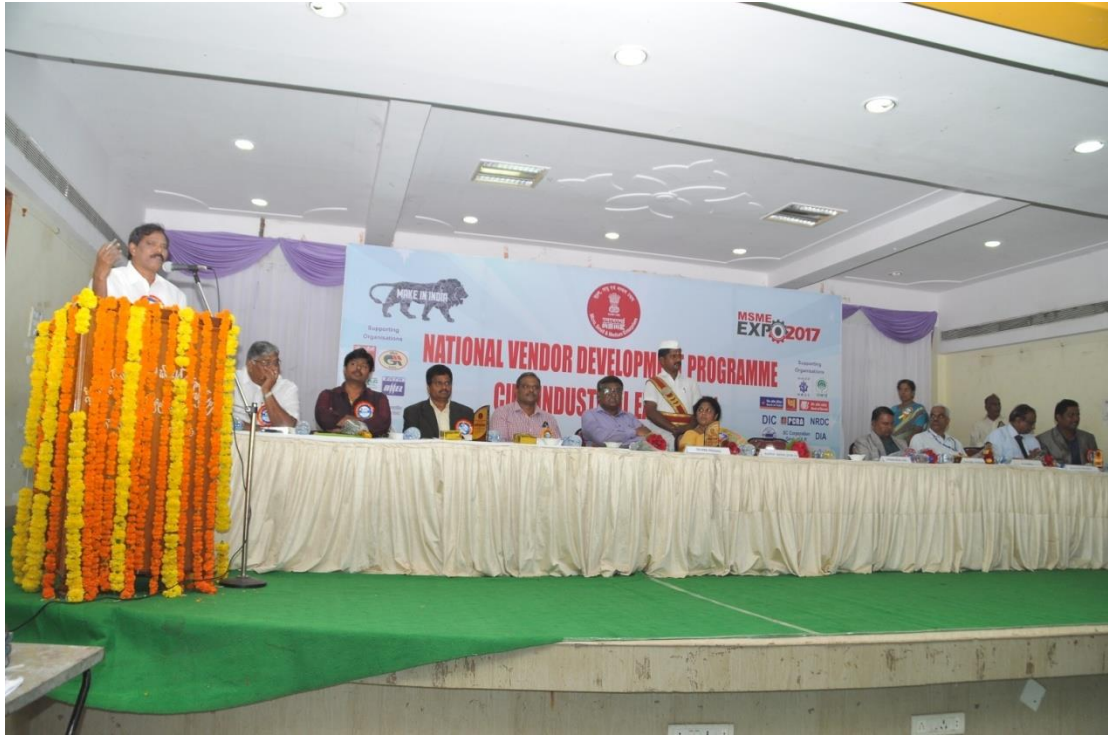
MSME-EXPO at Rajahmundry