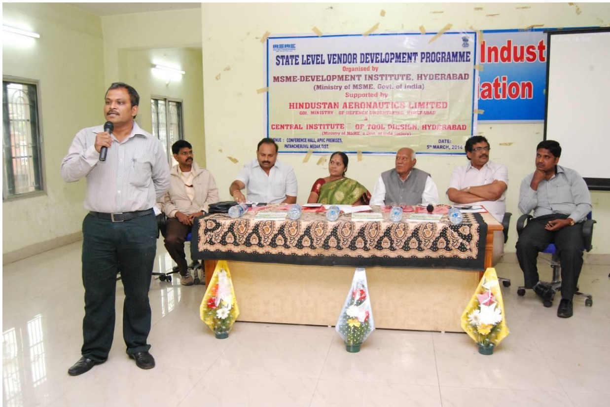
SVDP at Hyderabad with HAL. Motivation Campaigns