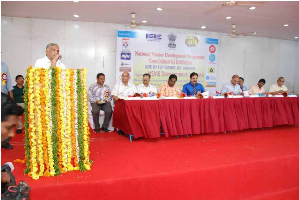
National Vendor Development Programme at Vijayawada :