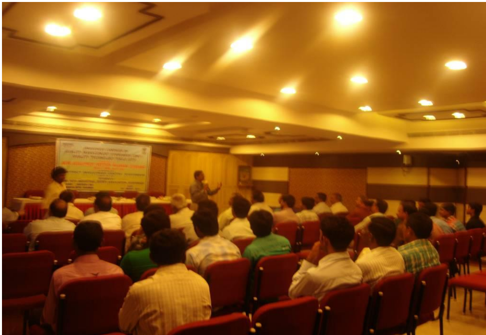
Awareness programme on QMS/QTT at Vijayawada: Technical session in progress