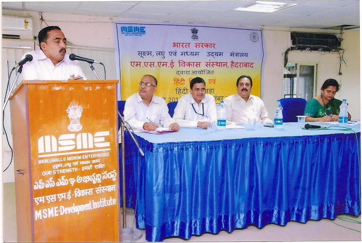
Hindi Day celebrations in progress