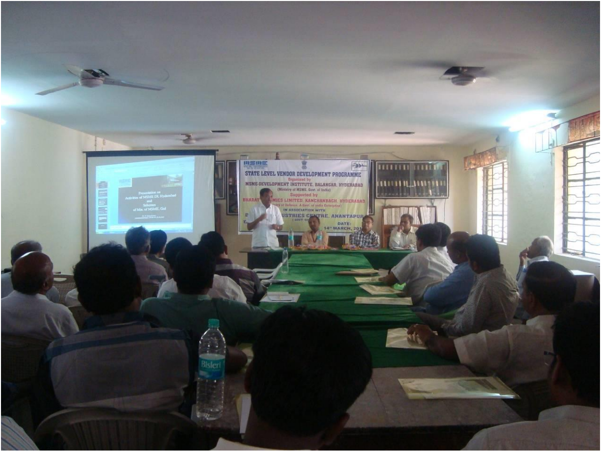
State Level Vendor Development Programme at Anantapur, with Bharat Dynamics Limited, Hyderabad