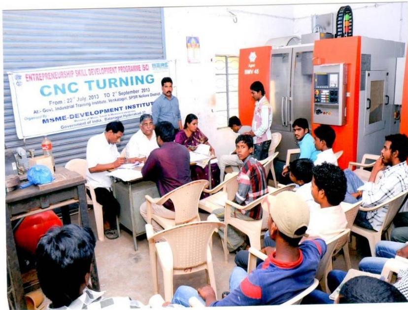
ESDP on CNC Turning and CNC Milling at Nellore