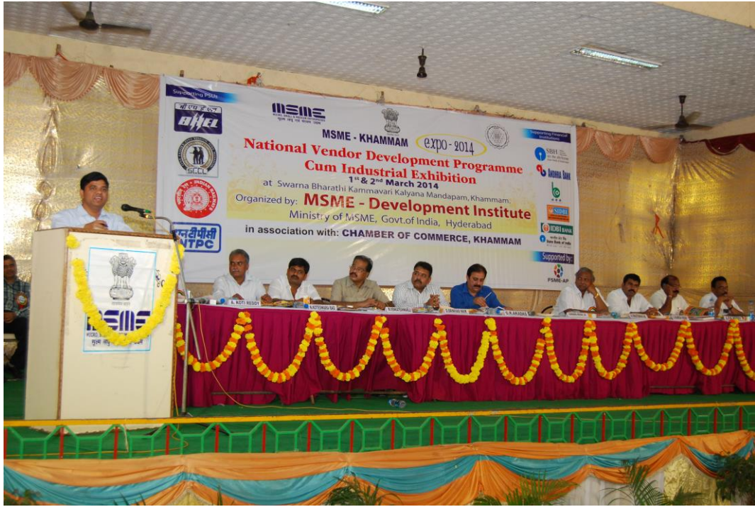
NVDP at Khammam - Chief Guest Jt District Collector addressing the gathering