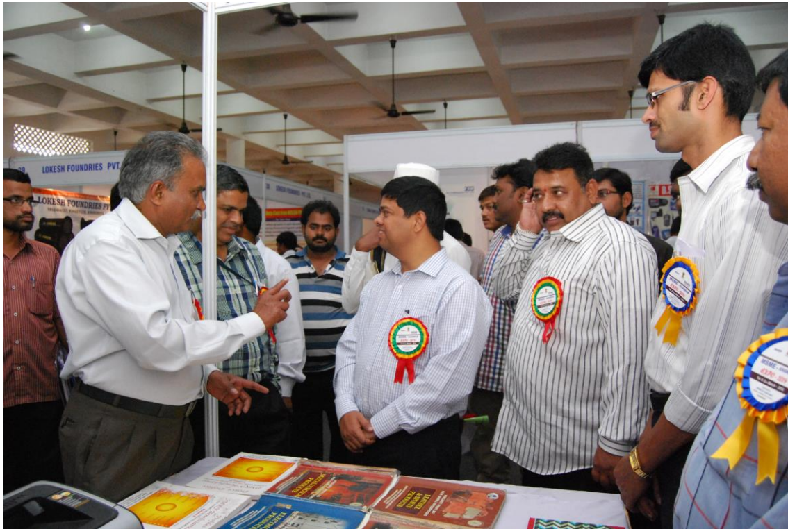
Chief Guest visiting MSME-DI stall at NVDP at Khammam