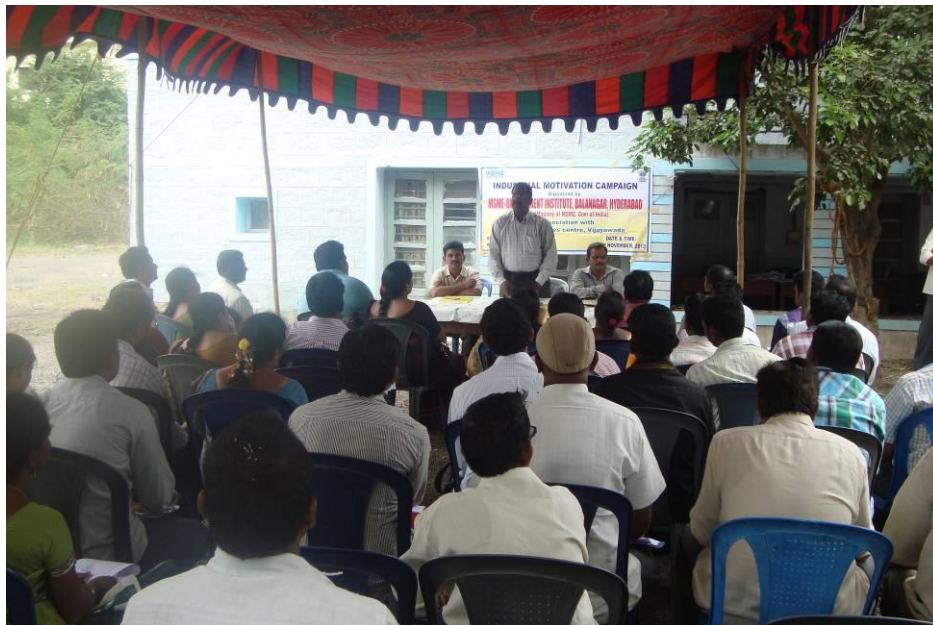
Industrial Motivation Campaigns at Vijayawada