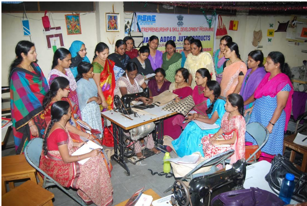
A training session in progress