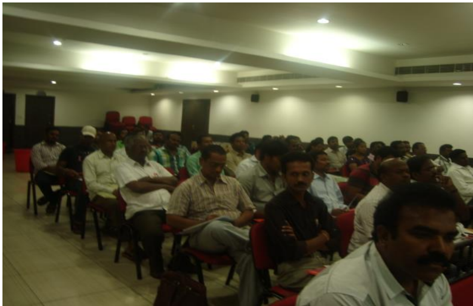
A section of the participants of Awareness Programme on Bar Coding at Srikakulam