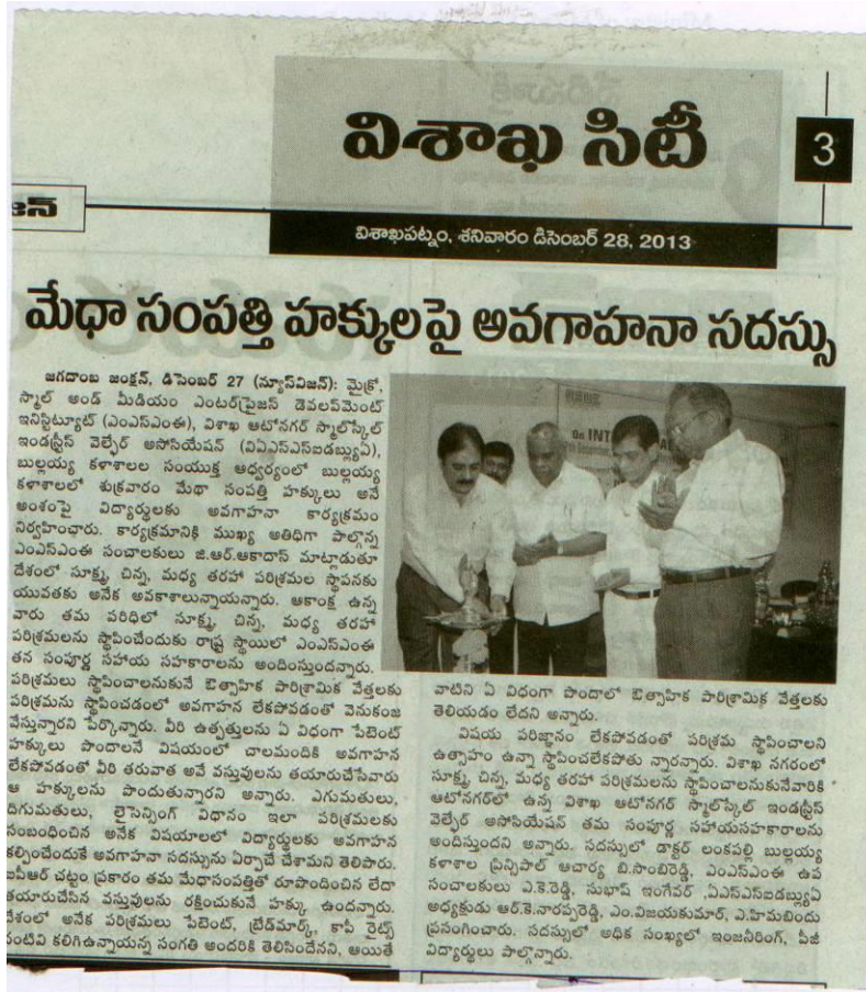
Newspaper clipping : Report covering Awareness programme on Intellectual Property Rights at Visakhapatnam