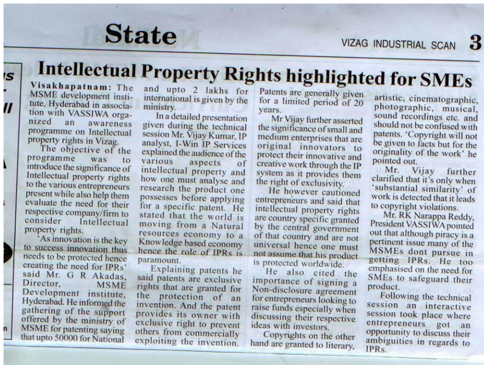
The Hindu clipping of the same event