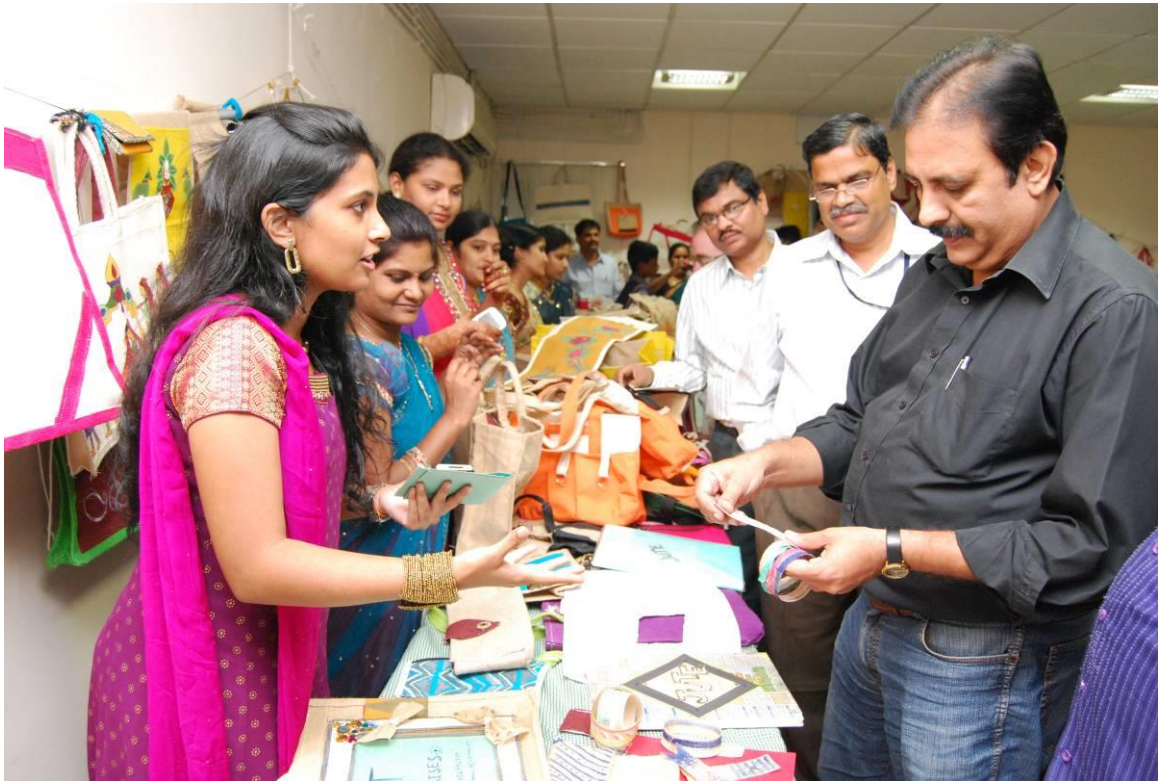
Trainee products on display