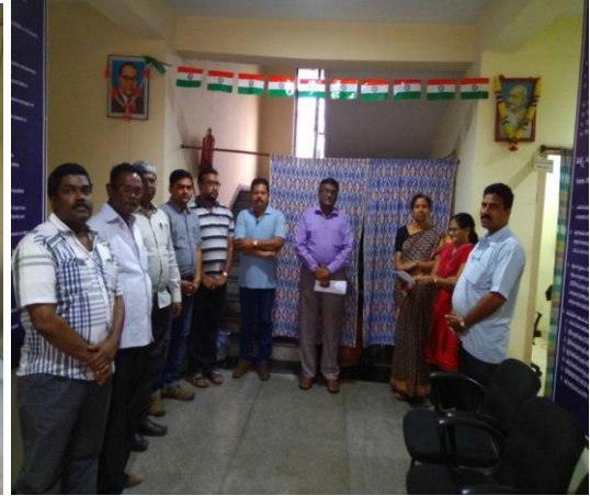
Vigilance Awareness Week Celebrated 31 st Oct to 5 th Nov 2016, officers and staffs were taking oath.