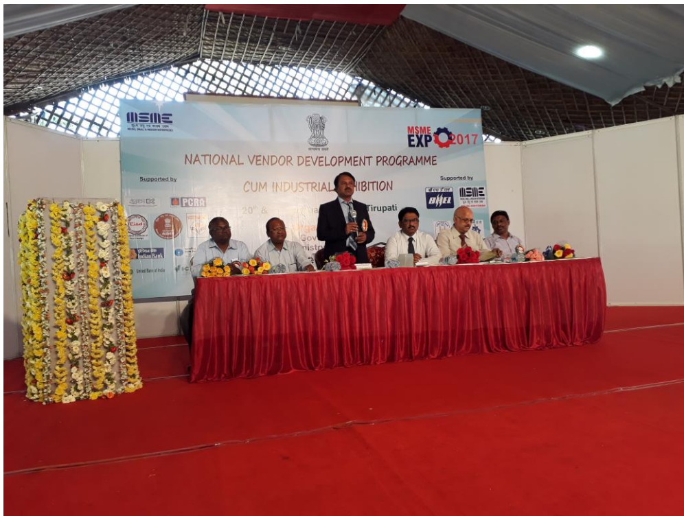
NATIONAL VENDOR DEVELOPMENT PROGRAMME MSME EXPO 2017, Tirupathi