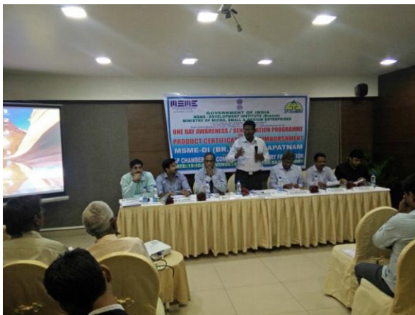
Awareness Programme on “ Product Certification” in association with AP Chambers of Commerce & Industry at Rajahmundry on 15-10-2016