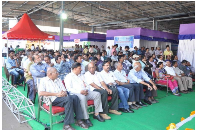
National Vendor Development Programme at Visakhapatnam from 9 th & 25 th Jan 2017.