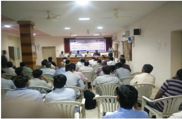
Awareness Programme on “ZED” conducted at Visakhapatnam on 28-02-2017