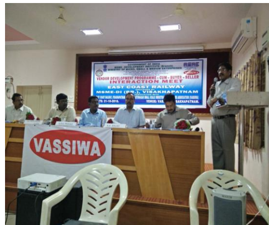
SVDP Conducted at Visakhapatnam in association with East Coast Railway of India on 21-10-2016.