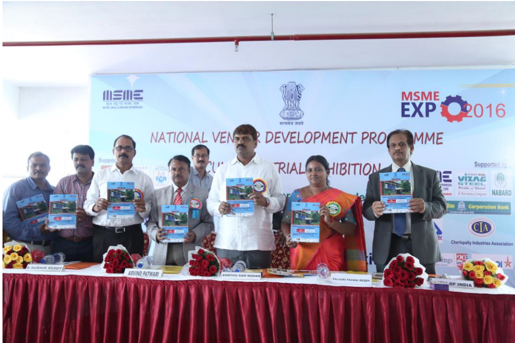
Release of Souvenir of NVDP Hyderabad