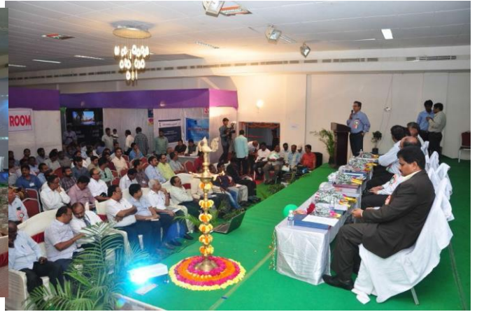
National Vendor Development Programme at Kakinada on 24 th & 25 th Jan 2017.