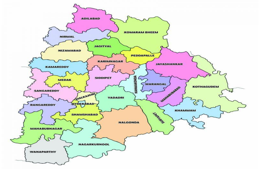
Telangana with 31 Districts