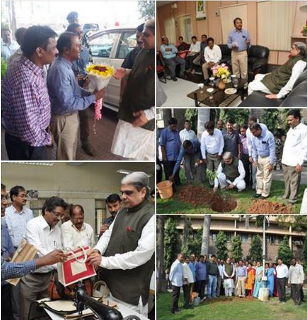
Shri Haribhai Parthibhai Chaudhary, Hon'ble Minister for State, Ministry of MSME, Govt of India visit to MSME-DI, Hyderabad on 28 October 2016