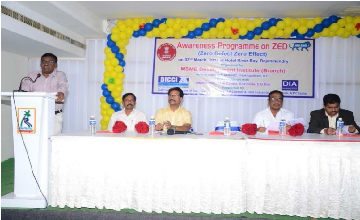
Awareness Programme on ZED conducted at Rajahmundry on 2 nd March 2017.