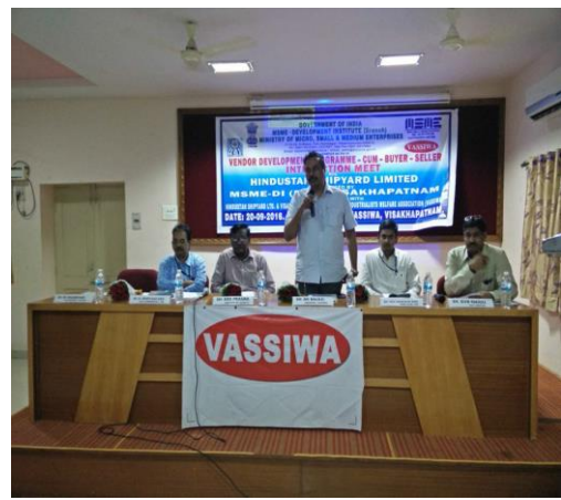
SVDP Conducted at Visakhapatnam in association with HSL of India on 20-09-2016