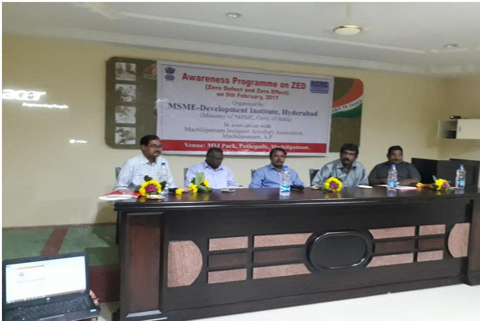
Release of Souvenir at NVDP, Visakhapatnam