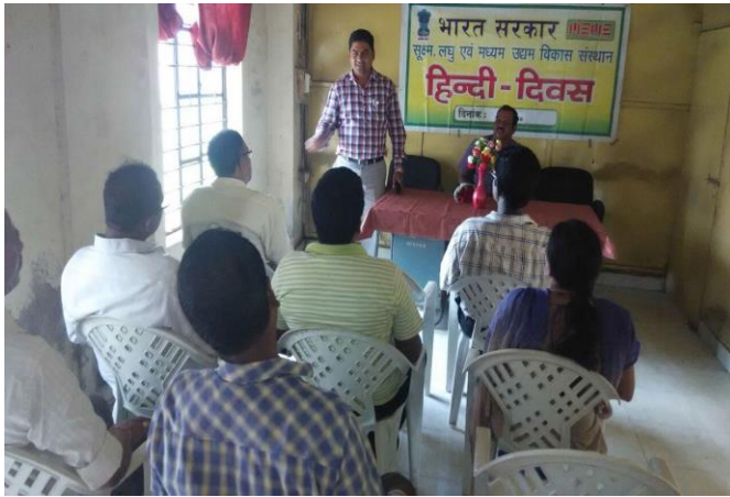
HINDI NIVAS celebrated in this office on 14 th Sept 2016.