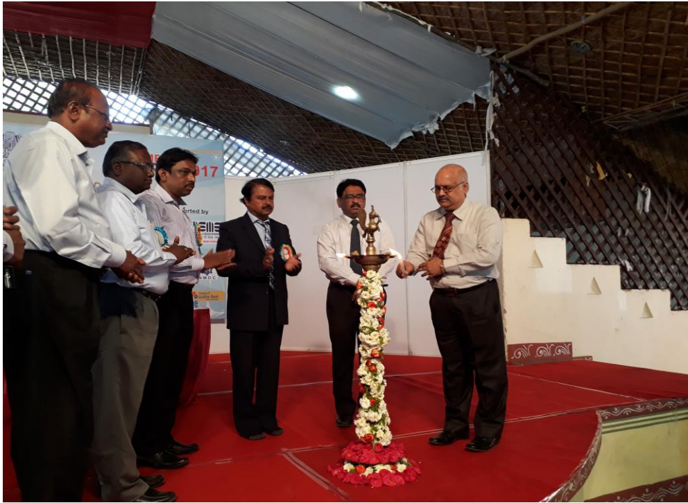
Lighting of Lamp NATIONAL VENDOR DEVELOPMENT PROGRAMME