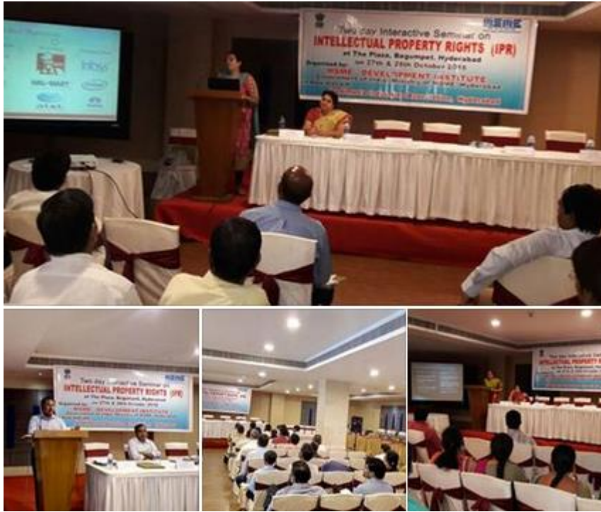
Two days Interactive seminar on Intellectual Property Rights was conducted on 27 & 28 Oct 2016 at Hyderabad