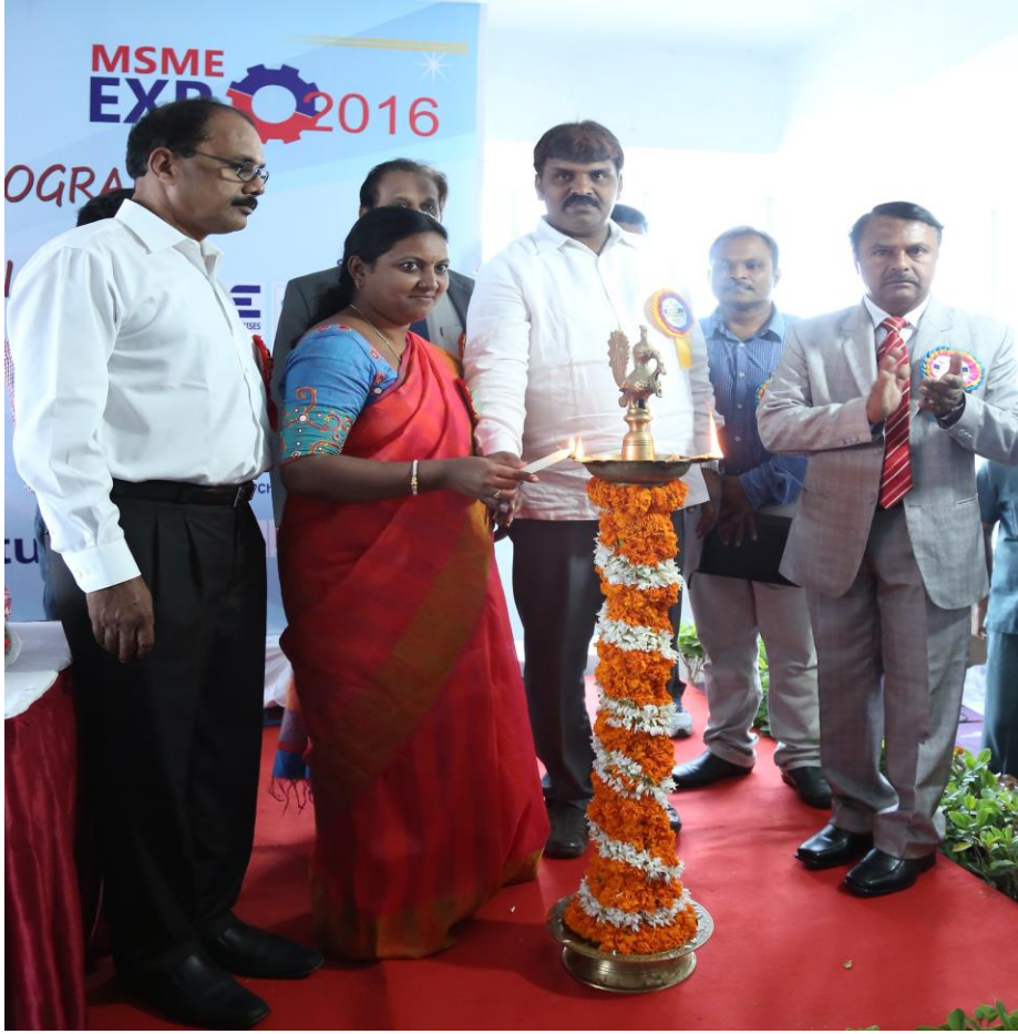
Lightening lamp by Mayor during the inauguration of National Vendor Development Programme at NSIC, Kushaiguda, Hyderabad on 16.12.2016