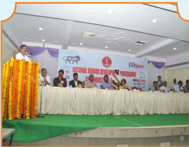
MSME-EXPO at Rajahmundry