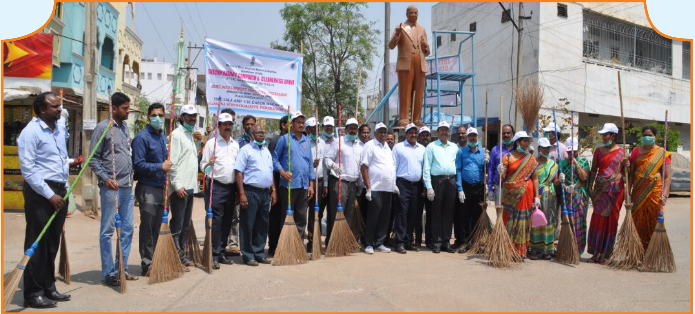
Swachh Bharat Campaign and Cleanliness drive conducted at Gandhinagar Industrial Estate Gandhinagar,

As part of Swachh Bharat Mission of Government of India and in accordance with Ministry's directions, MSME-DI conducted two campaigns and cleanliness drive in the month of March-2018.