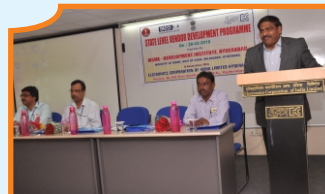
State level Vendor development programme organized with Electronic Corporation of India Limited (ECIL), Hyd.