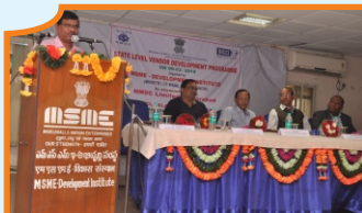
State level Vendor development programme organized with NMDC Limited, Hyderabad

A glimpse of SVDPs conducted during the last quarter Jan-Mar, 2018