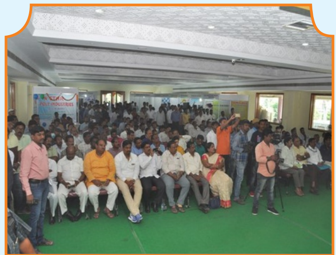
Delegates and Dignitaries in EXPO at Rajahmundry