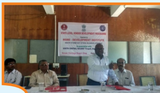
State level Vendor development programme organized with South Central Railways, Tirupati