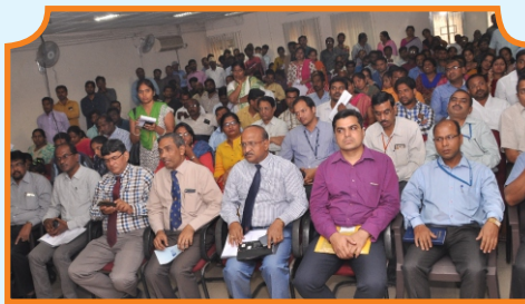
Photo 2: Glimpse of participants at the Loan Mela