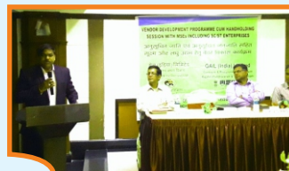
State level Vendor development programme organized with Gas Authority of India Ltd.(GAIL), Vijayawada