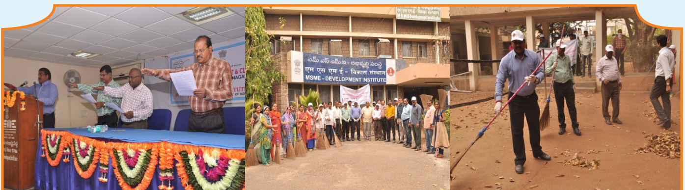
MSME DI officers seen taking pledge and cleaning office premises

Swachh Bharat Campaign was conducted at MSME-DI, Hyderabad office premises on 15 th March 2018. Officers of MSME-DI cleaned the office premises after taking Swachhata Pledge administered by Additional Industrial Adviser.