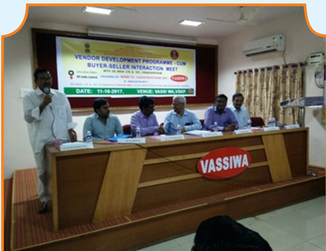
State Level Vendor Development Programme Conducted in Visakhapatnam.